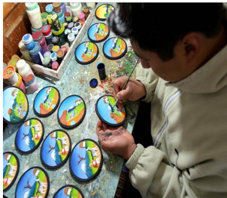
This artist and entrepreneur sells his clay and plaster sculptures to tourists that visit his hometown of Pujili in Cotopaxi. Access to USAID-supported micro-credit allowed him to purchase raw materials used for his artwork.